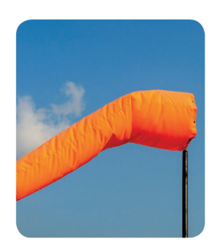
Do not use inflatable toys or airbeds in the sea when a wind sock is blowing.