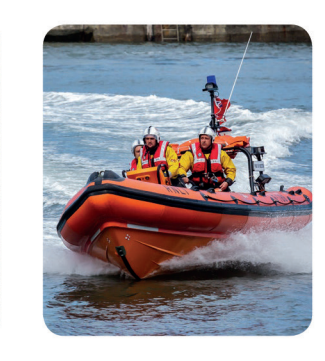
Call 999 in an emergency. Ask for the coastguard and they will call for the lifeboat.