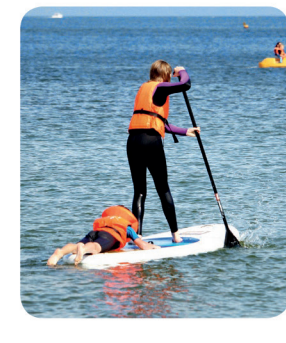
Use safety equipment, such as a life jacket.