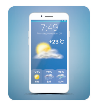
Check the weather forecast for bad weather.