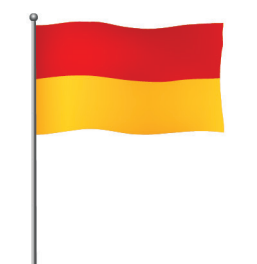
Red and yellow flags mean it is safe to swim.