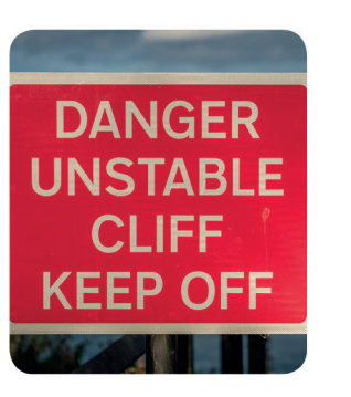
Look for warning signs, follow advice and do not take risks.

The coastline can be a dangerous place. It is important to stay safe and know what to do in an emergency.