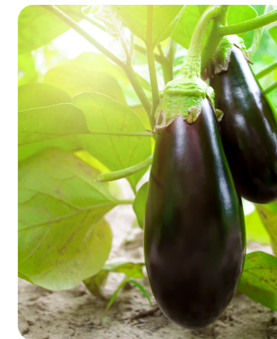
healthy aubergine plant

Plants need space to grow. If an area is overcrowded, the nutrients and water in the soil are used up. Overcrowding also blocks sunlight.