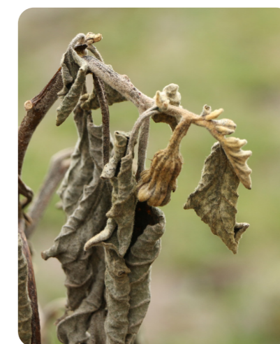
unhealthy aubergine plant