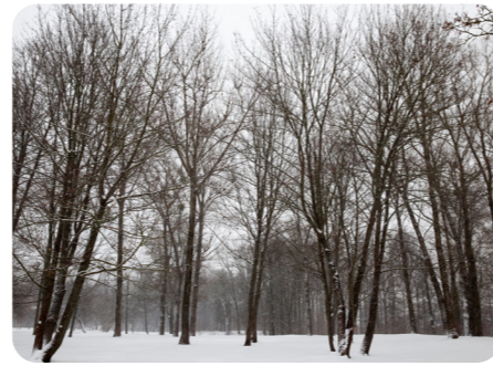
deciduous trees in winter

Trees can be deciduous or evergreen. Deciduous trees lose their leaves in autumn and have bare branches in winter. Evergreen trees shed old leaves and grow new leaves all year round, which means they keep their leaves in winter.