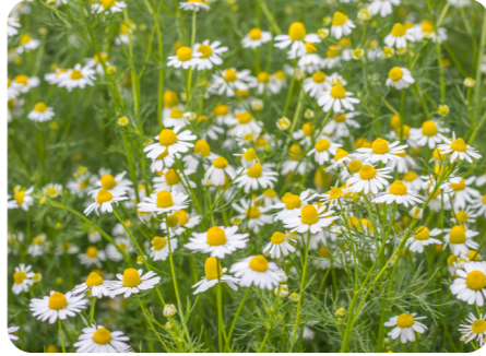
Daisies grow in meadow habitats.