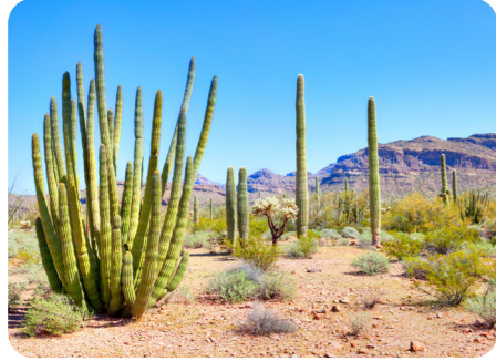
Cacti grow in desert habitats.

Plants are living things that change with the seasons. They grow in different habitats.