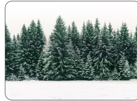
evergreen trees in winter