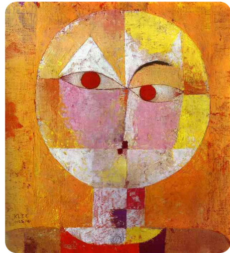
This painting, by Paul Klee, is called Senecio (Old Man) . The shape and colour of the face have been distorted, but it is still recognisable as a face.

In the art world, the term distortion is used to describe any change made by an artist to the shape, size or visual character of a form to express an idea, convey a feeling or enhance visual impact.