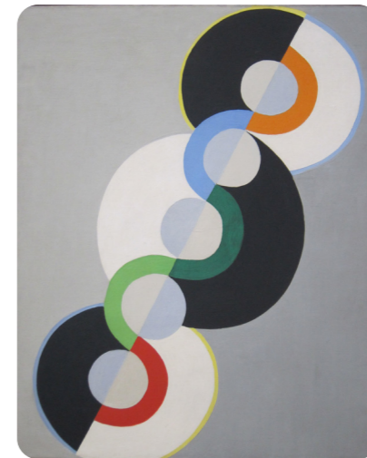
This painting, by Robert Delaunay, is called Endless Rhythm . It represents the movement of music through endlessly connected circles and loops.

Orphism was an abstract painting style developed by married artists Robert and Sonia Delaunay around 1912. It was based on Cubism but pioneered a new emphasis on bright colours and abstract shapes to create energy and movement.