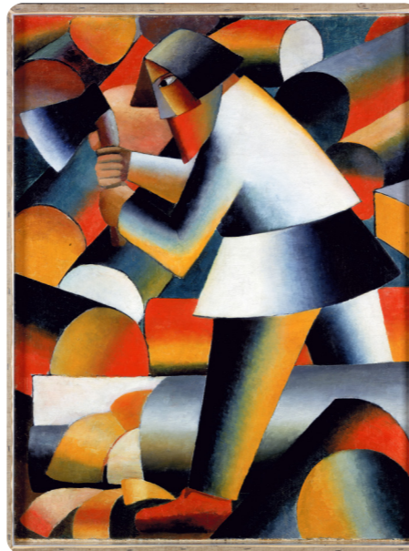
Some artworks reduce their subject matter to basic shapes, such as The Woodcutter by Kazimir Malevich.