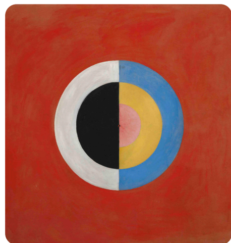
This painting, by Hilma af Klint, is called The Swan No. 17 . The subject matter has been reduced to pure shape and colour. Without knowing the title of the piece, the viewer would not know that the painting represents a swan.

Abstract art takes recognisable objects or forms and changes them until they no longer look realistic. Abstract art allows artists to freely communicate their ideas in a way that is not limited by reality. The artist may leave out details, change the point of view, exaggerate the size, distort the shapes and colours or twist and simplify forms.